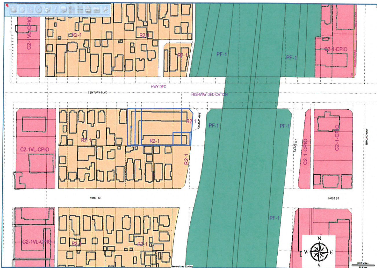
ZIMAS Generalized Zoning Map, 2017

The subject property is located on the southwest corner of Century Boulevard and Grand Avenue. The site consists of four relatively flat lots and a portion of a fifth lot that are tied together for a total lot size of approximately 26,214 square feet. The corner lot is irregularly shaped and the remaining lots are rectangular. The property has a frontage of approximately 225 feet on the south side of Century Boulevard and depths of approximately 115 feet.